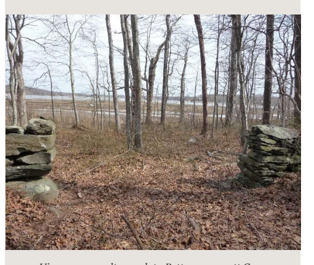
View across salt marsh to Pettaquamscutt Cove

Trail start: Narragansett Community Center, 53 Mumford Rd, Narragansett, RI